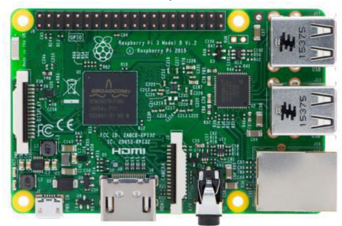
Figure 2: Raspberry Pi 3

The Raspberry Pi 3 isn't like your typical machine, in its cheapest form it doesn't have a case, and is simply a creditcard sized electronic board -- of the type you might find inside a PC or laptop but much smaller. The Raspberry Pi 3 is used for making robot wireless and web based.ge Raspberry Pi and then the videos are transmitted wirelessly from the robot to the user's monitor, from where the user can conveniently control the robotic vehicle's movement and also the robotic arm movement. Raspberry pi is connected with the dongle which enables raspberry pi to transmit over the web network. Raspberry-Pi Module Raspberry Pi uses an SD card for booting and for memory as it doesn't have an inbuilt hard disk for storage. Raspberry Pi requires 5 volt supply with minimum of 700- 1000 mA current and it is powered through micro USB cable. ARM11 only requires 3.3 volt of supply which it takes with the help of linear regulator. 5 volt is required for the USB ports. It operates at 700M Hz. We use python or embedded C to write code into the raspberry pi. It has a strong processing capability due to the ARM11 architecture and Linux-based system.